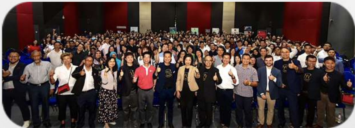
Photo taking session with the Guest-of-Honour, Senior Minister of State for Culture, Community & Youth, and Communications & Information, Ms Sim Ann.